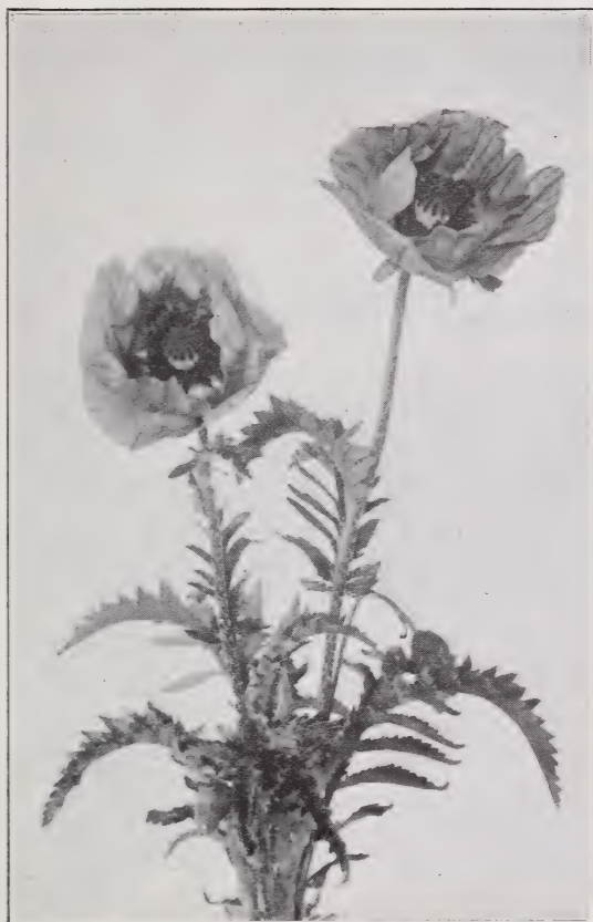
PAPAVER ORIENTALE (Oriental Poppy)

The Oriental Poppies ( Papaver orientale ) form a gorgeous set of perennial plants. The immense size of their flowers and their striking colors make a wonderful display. We are offering the following varieties that can be supplied in field-grown plants dormant in August and early September.